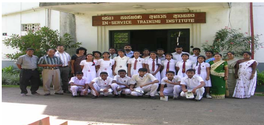
Workshop on 'Safe use of Pesticides'

The impact of floods as the next 'Sanhinda' programme will be held on 21 st August 2008.