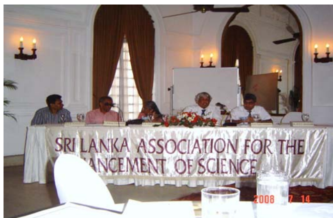
Symposium on Water Trends