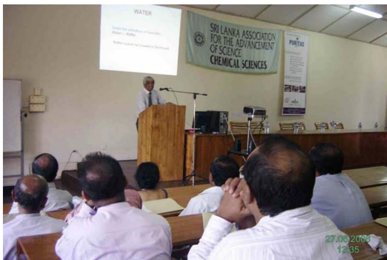
SLAAS General President at Seminar on “Industry and Environment”