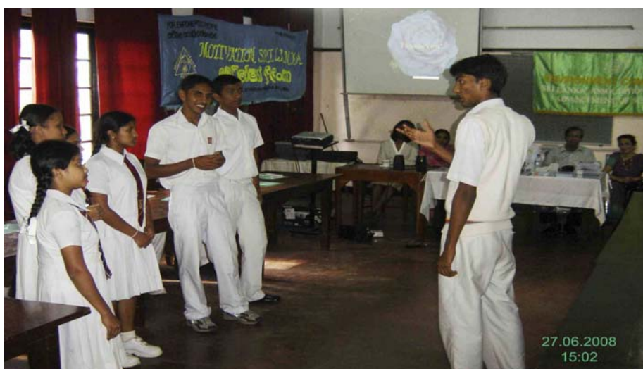
Students enacting a drama on 'Safe use of Pesticides'