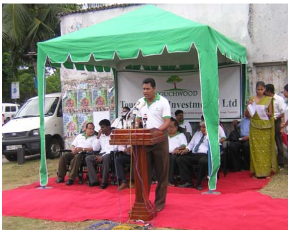
Touchwood representatives addressing the event